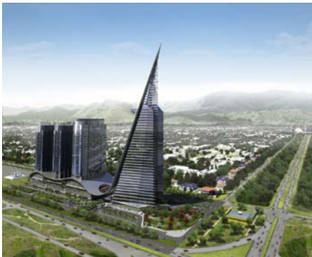
The Centaurus in Islamabad