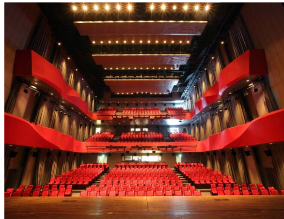
Left: BIFF open-air theatre with seating for 4000 beneath outdoor roof with LED lighting Right: Multipurpose screening hall with close to 840 seats

Kinoton Korea, our agency for the South Korean market, installed an FP 25 D film projector with an 8000-watt Gigalight lamphouse to fill the large outdoor screen, which measures 24 by 13 meters (79 x 42 feet). To offset the ambient light that is typical of open-air shows, Kinoton Korea chose a pearl-white screen, which ensures sufficient illumination for bright movie pictures. Between shows, a special outdoor screen cover shelters it from the weather to preserve its high reflectivity.